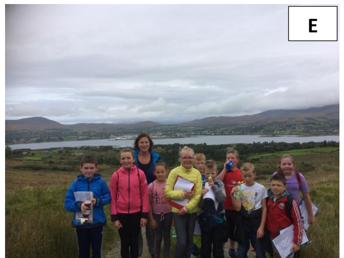
Bere Island Talent show