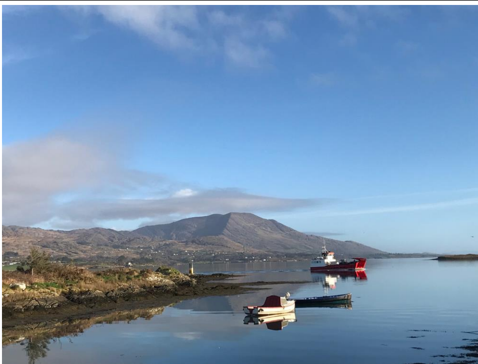
Above: Oileáin na gCaorach on a sunny day