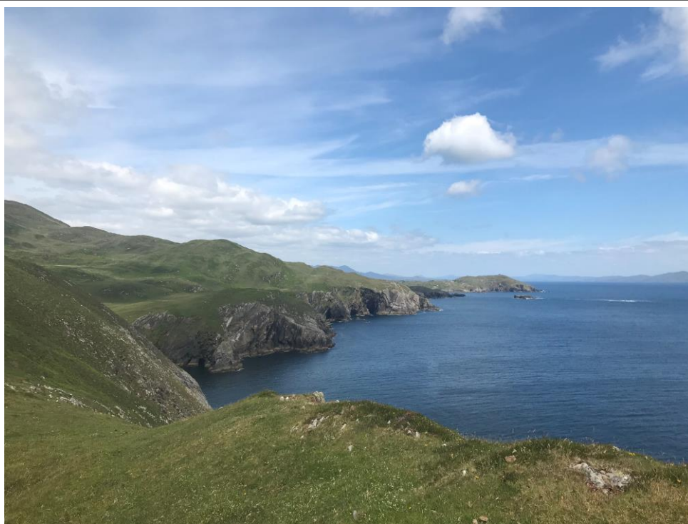
Above: Greenane, Bere Island