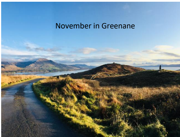
November in Greenane

Available from Murphy's Shop, Bere Island and Super Valu, Castletownbere