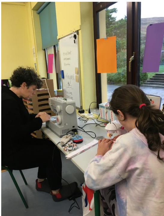
Left: The school sewing hair scrunchies Right: The school taking part in STEM/ Science week

Lastly, the payback time for investment in solar PV has, due to the soaring energy prices, reduced hugely, making it an even more beneficial option to consider. (Submitted by the BI Energy Group)