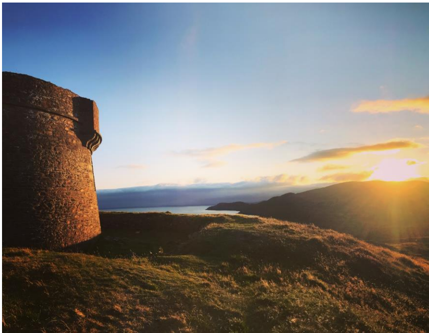
Above: Winter sunset at Cloughland Tower.

Wishing all Bere Islanders at home and abroad a Merry Christmas & Best Wishes for 2023