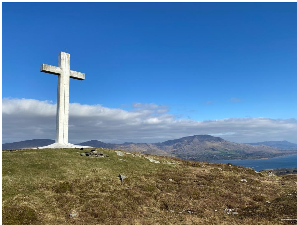
Above: The Holy Year Cross.