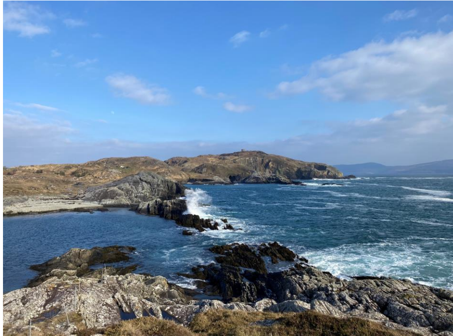
Above: A view of Greenane.