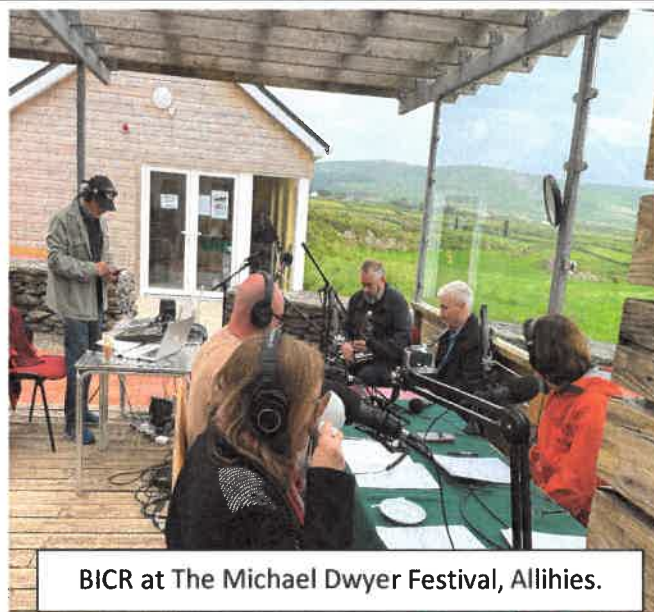
BICR at The Michael Dwyer Festival, Allihies.