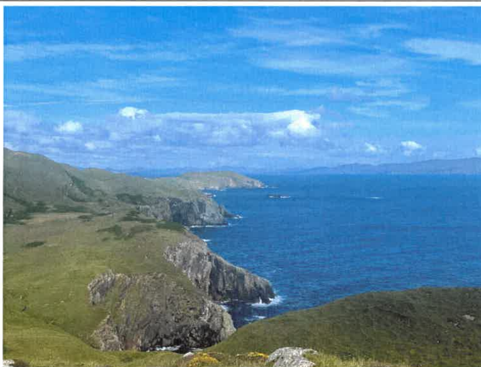
Above: Greenane Coast Line.