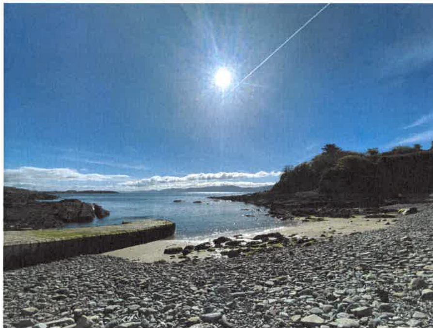
Above: Sunrise at Cloughland.