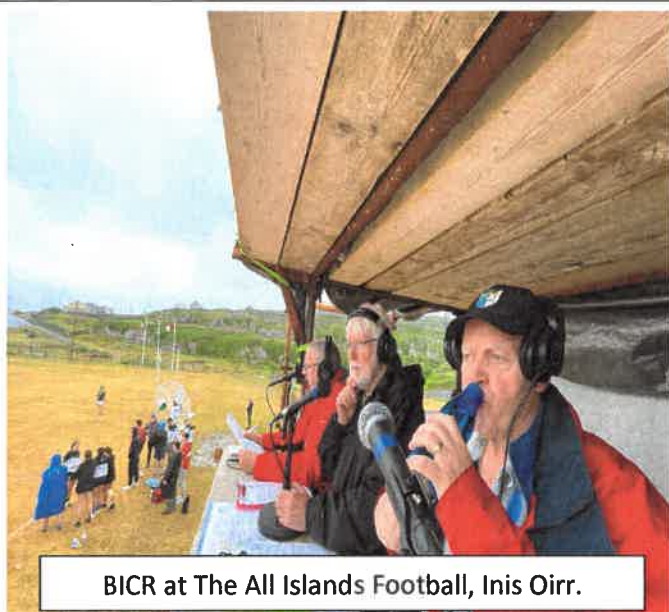
BICR at The All Islands Football, Inis Oirr.

We are always looking for Responders to join our group please call 086 1621803 to receive free training to become a Community First Responder.