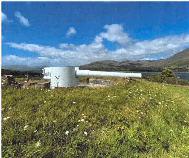
Above: Lonehort Battery Gun