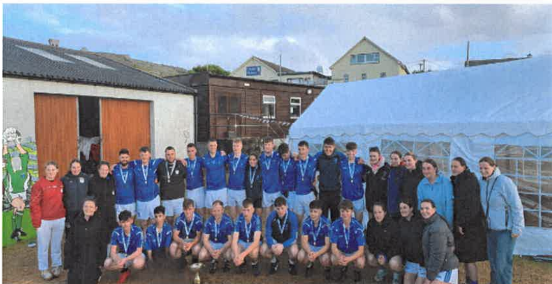
All Island Football Tournament Bere Island Men's and Ladies Teams.