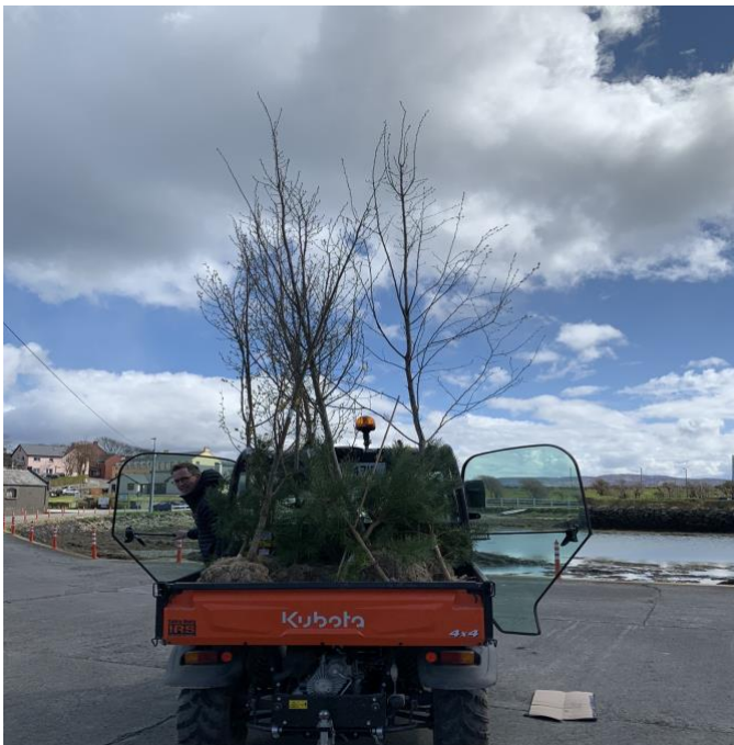
First delivery of Scots Pine - our favourite tree.