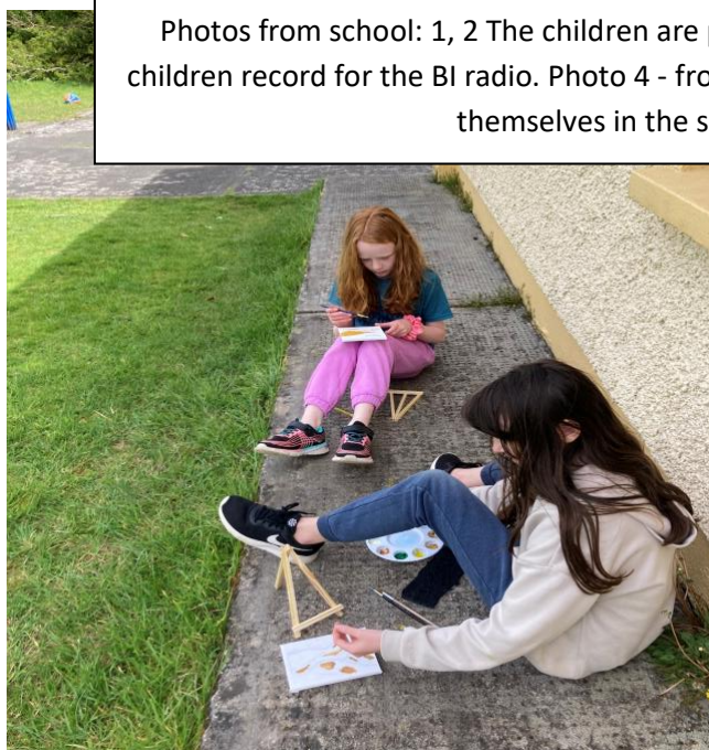
Photos from school: 1, 2 The children are painting impressionist paintings. Photo 3 – The children record for the BI radio. Photo 4 - from Sciath na Scoil. Photo 5 – The children arrange themselves in the shape of a basking shark.