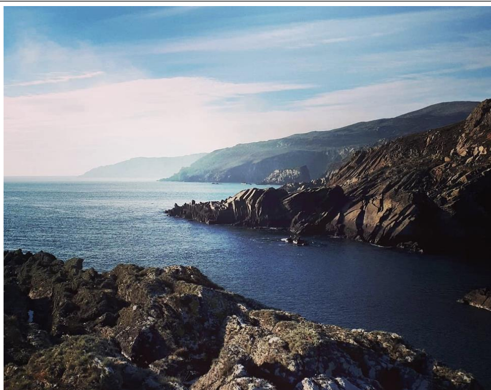
Above: View of Shee Head Bere Island.