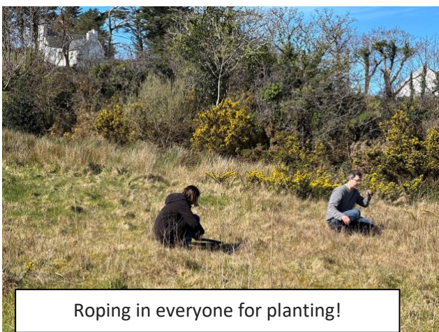
Roping in everyone for planting!