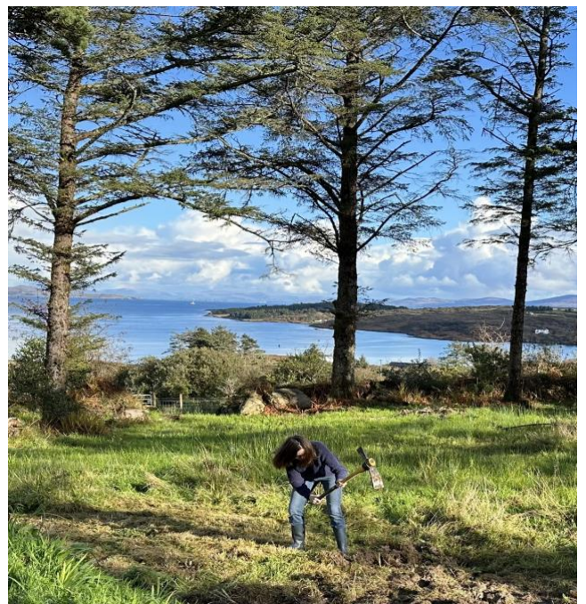
We used the Bere Island community rotavator and some hard work to plant a garden to grow saplings.