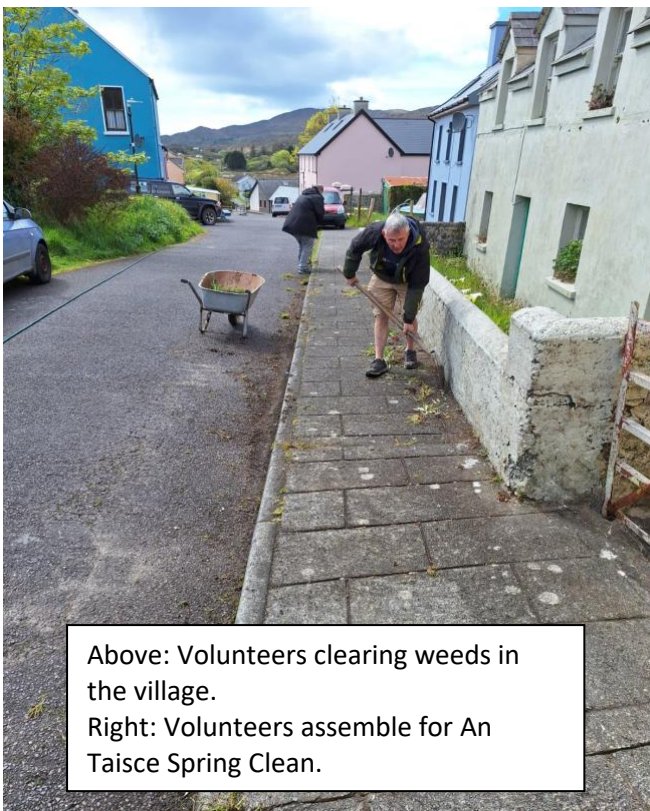
Above: Volunteers clearing weeds in the village. Right: Volunteers assemble for An Taisce Spring Clean.

Please note the collection on 5 th July is on a Friday. Rubbish stickers are priced €10 and are available from Murphy's Shop, the Heritage Centre. Rubbish bags should be left out by 5pm on the day of collection. Please do not leave rubbish bags out in advance of the collection dates. If you are leaving the island contact Caitriona (Wild Atlantic Glamping) 086 6027819 who will arrange somewhere secure for the bags to be dropped to and stored until the collection date. Please note individual bags should not weigh over 15kg. The new recycling collection facility will also continue through the summer months. On the days of the regular waste collection, bags of recycling will also be collected. Papers, plastics (wrappings and bottles) and cardboard can be placed in these bags. They should be left outside with your usual rubbish collection. Please note glass bottles and cans should still be brought to the recycling centre, along with any large cardboard items. Please ensure that all cans and bottles brought to the recycling centre are clean, and if possible crush any cans before they are deposited in the appropriate container. A clothing bank is also in operation at the recycling centre for clothing. There is a donations box at the recycling centre, all money received goes towards running the centre, and operating the waste collection service. If you would prefer to give a yearly donation this can be done via bank transfer. Please contact a member of the committee for bank details.