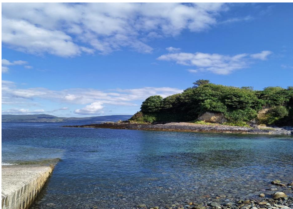
Above: Cloughland Pier.